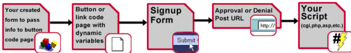
Figure 2 – Data Flow with Multi-Part Form and Dynamic Variables

The form you create will pass data entered by the consumer to the next form, which will then pass the variables to the EC Suite signup form. Upon completion of the transaction, data will be sent to the Approval or Denial Post URL.